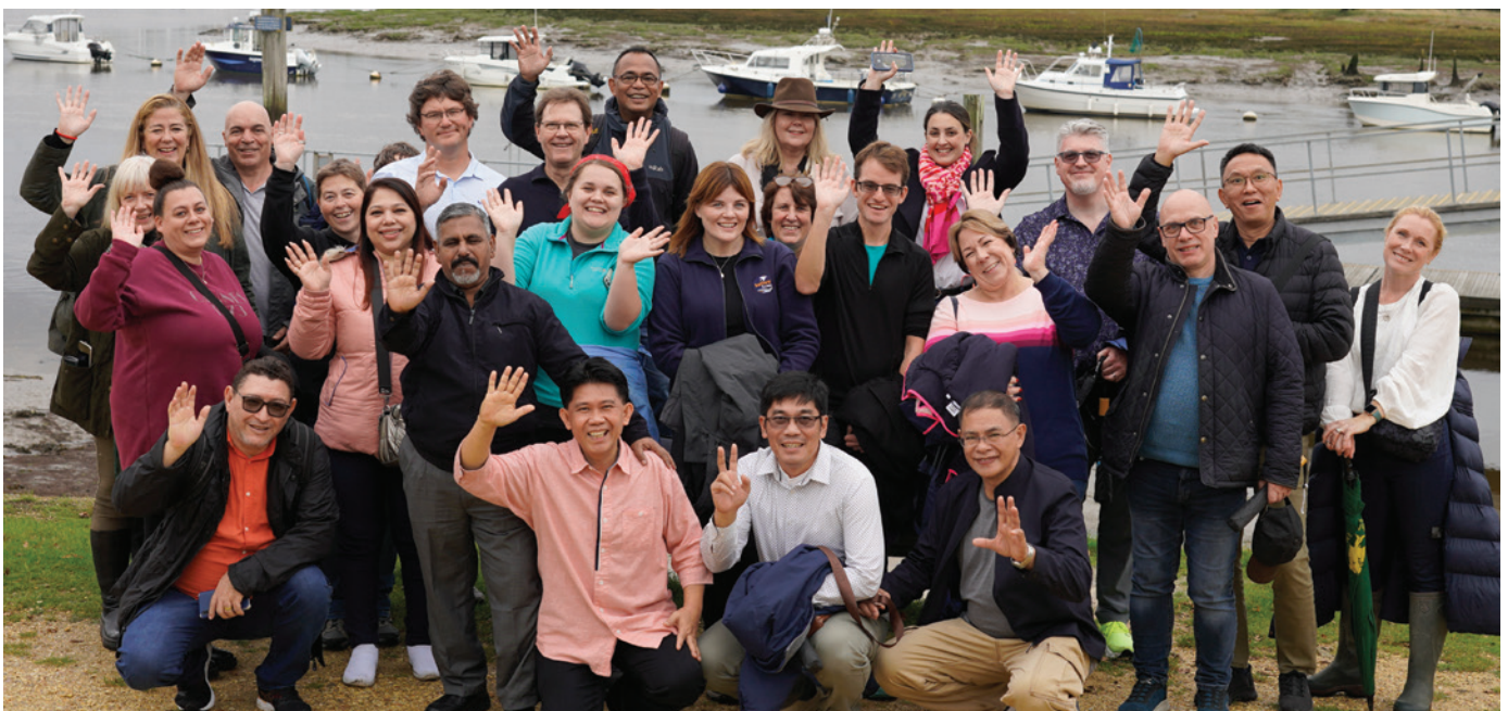
Global Conference 2024